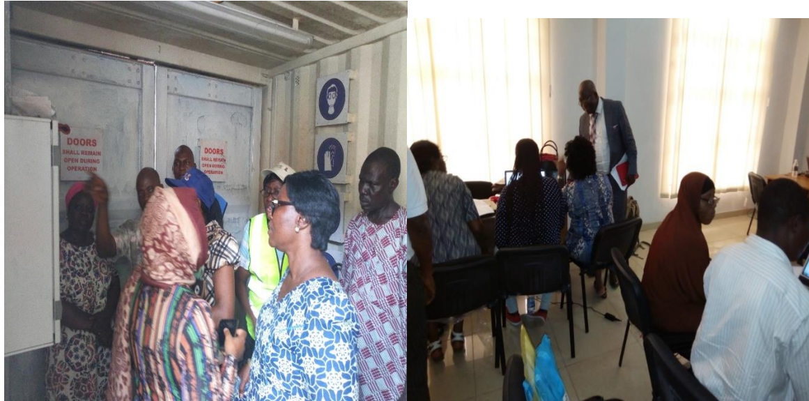
Vaccine Security at the State & LGA level. During Dissemination Meeting @ Ibs On MICs And Health Facility Survey Report